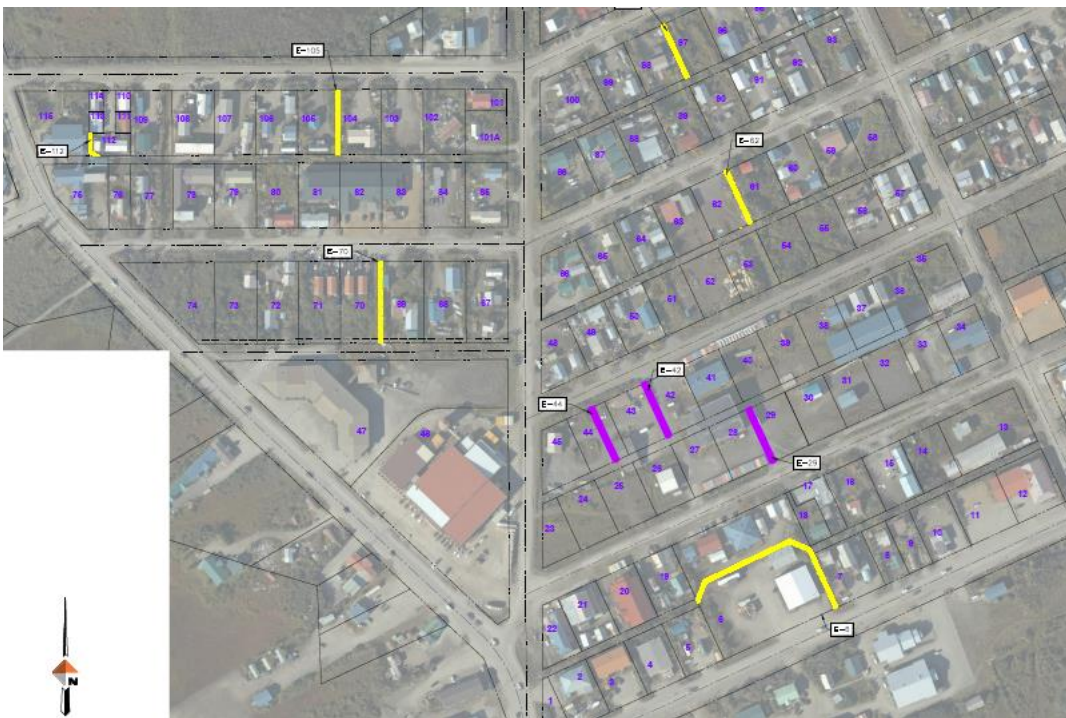
Property transfer indicated in yellow.

Beginning at the southeasterly corner of said U.S. Survey 3046, being common to the southwesterly corner of Lot 7, Block 10, U.S. Survey 3230, and the True Point of Beginning for this description; thence S65°12'37"W 10.00 feet to a point on the southern line thereof; thence departing said line N24°47'24"W 150.81 feet; thence N67°09'49"W 47.54 feet; thence S63°23'10"W 224.39 feet; thence S21°03'29"W 47.23 feet to a point on the westerly line thereof; thence N24°47'24"W 13.94 feet to a point along said line, being common with the southeasterly corner of Lot 1, Block 9, U.S. Survey 3230; thence departing said line N21°03'29"E 41.40 feet; thence N63°23'10"E 232.87 feet; thence S67°09'49"E 56.03 feet to a point on the easterly line thereof; thence S24°47'24"E 154.68 feet to the True Point of Beginning. Said easement embraces an area of 4,775 square feet, more or less as calculated from said courses and distances.